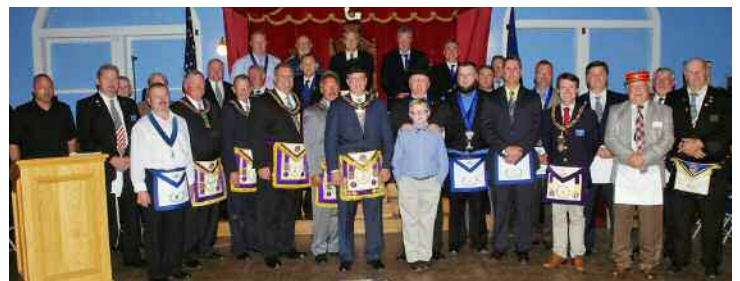
Attendees of Dedication Ceremony