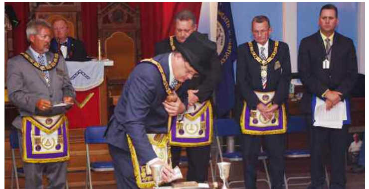
The Grand Master (center) and Grand Line Dedication Ceremony