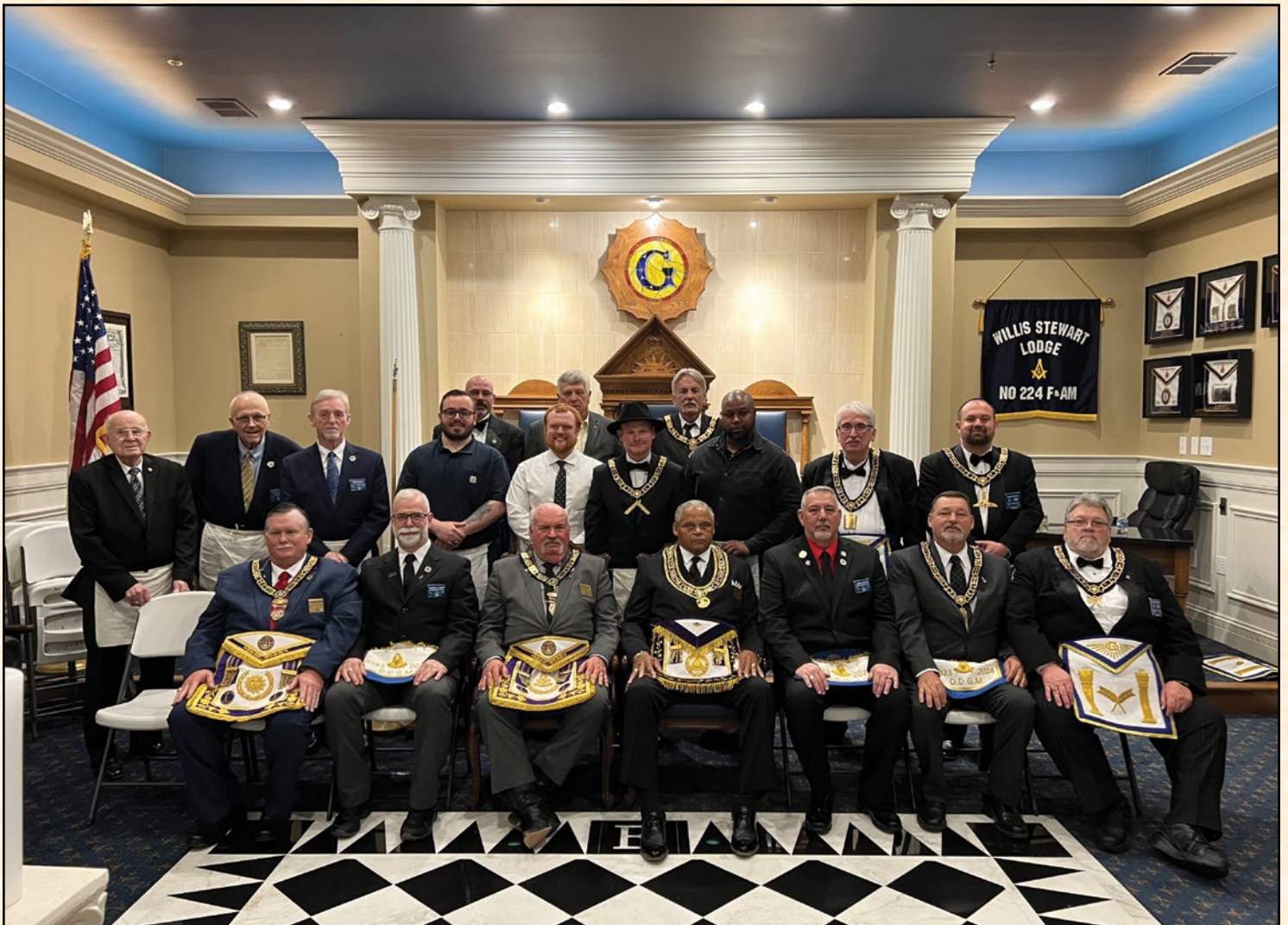
Visiting Dignitaries and Officers of Willis Stewart Lodge #224 and our three newly raised Brothers.