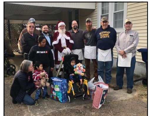
All the lodges in West Kentucky took part in making a donation to buy a special needs cerebral palsy girl a wheelchair so she could start school. Masonry at work.