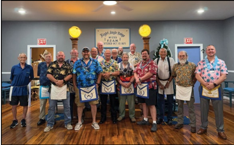
At a stated communication of Right Angle Lodge #233 was our first annual Hawaiian shirt night. In attendance was brothers from several lodges.