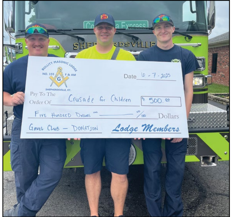
Bullitt Lodge #155 gave a donation to the Crusade for Children accepted by the Shepherdsville Fire Department.