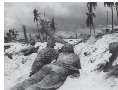
U.S. Marines advance on Japanese pill boxes on Tarawa Atoll in November 1943.