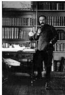
Kipling in his study at Naulakha, Vermont in 1895.