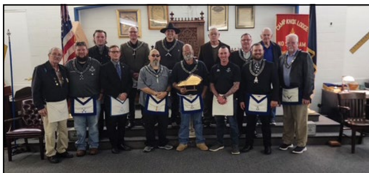
The brothers of Camp Knox #919 celebrate the presentation of their 2025 Lodge of Excellence plaque at their Stated Communication.